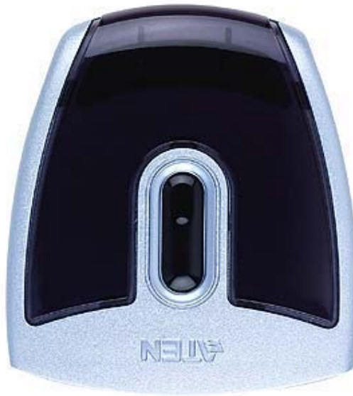
→ Rear View